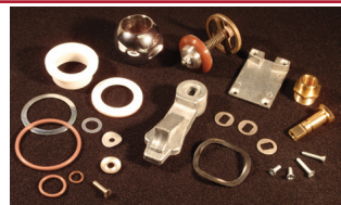
05934 Nozzle Rebuild Kit